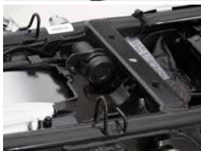
12V Socket Kit 08U70-MGC-J80 Power or charge electrical equipment using this convenient 12V Socket (Provides 2A). € 79.00