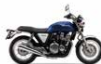
Pearl Hawkseye Blue