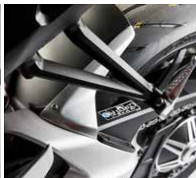
Rear Fender Panel* 08F78-MKJ-D00

Seat cowl matching the colour of the bike, fitted with a high quality aluminium panel. To be installed instead of the passenger seat. 3 colours available: • Candy Chromosphere Red (08F80-MKJ-D00ZA) • Mat Bullet Silver (08F80-MKJ-D00ZB) • Graphite Black (08F80-MKJ-D00ZC) € 268.00