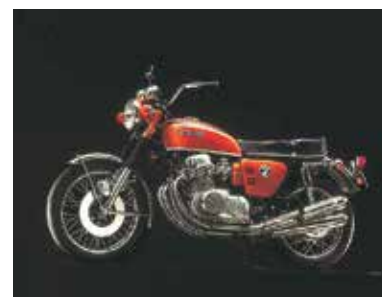
The Dream CB750 FOUR, which hit the market in July 1969

After 5 consecutive titles in the World Grand Prix Road Racing Series, Honda decided to withdraw and turn toward its primary target: transfer the technology obtained in competition to develop high-performance consumer machines. After a first attempt with a 450cc, Honda released the CB750 Four in January 1969. The initial production forecast of 1,500 units a year became soon a monthly figure and then jumped to 3,000 units/month. By pushing the boundaries of performance, reliability and easy handling in motorcycles, Honda created a new class of Superbikes. The CB1000R is the modern expression of the same spirit that guides Honda engineers since decades.