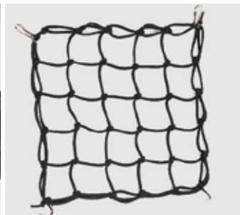
Cargo net 08L63-KAZ-011

Required to fix the seat bag to the unit carrier. € 335.00 / € 45.00