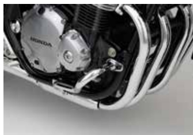
Tubular Engine guard 08P70-MGC-J80 / 08P70-MGC-JD0 Protects the surface of the engine cover Available in 2 colours: • Chrome plating (08P70-MGC-J80) • Mat Ballistic Black Metallic (08P70-MGC-JD0) € 275.00