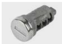
Key Cylinder Inner Set 08M70-MJE-D03

Cylinder inner set for one key system (wave key) Allows the pannier or topbox to be used with the bike's ignition key. One set required per pannier or topbox.