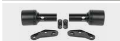
Engine guard with sliders 08P71-MGC-J80 Black mushroom-style sliders protecting your engine covers. € 379.00