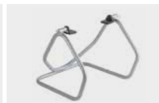
Rear maintenance stand 08M50-MW0-801 Tilting tubular steel stand that facilitates cleaning and rear wheel maintenance. Lifts the motorcycle by the end of its swingarm. € 99.00