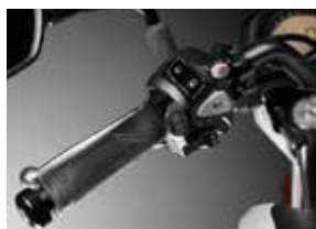
Heated Grips Kit 08ESY-MJF-HG1617

Extremely slim heated grips with integrated control for maximum comfort and design integration. 3 step variable heating levels. Integrated circuit to protect the battery from draining. Smart heat allocation that focusses on the area of the hands most sensitive to cold. Attachment and special heat-resistant glue included. € 388.00