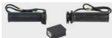
Heated Grips Pack 08ESY-MGC-HG17 Pair of extremely slim heated grips with integrated control for maximum rider comfort and design integration. 3 steps of variable heating levels with a smart heat allocation focussing on the hands areas the most sensitive to cold. Integrated circuit to protect the battery from draining. Attachment included (08I70-MGC-DA0) Special heat-resistant glue available* (*) Sold separately € 375.00