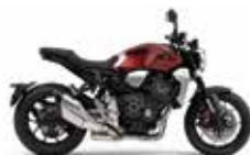
Candy Chromosphere Red