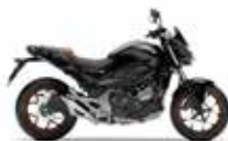
Graphite Black / Pearl Brown