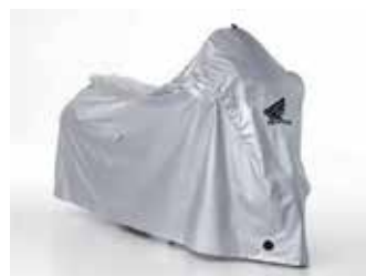
Outdoor cycle cover XL / Outdoor cycle cover XXL 08P34-BC2-801 / 08P34-MCH-000 Protects paintwork against U.V. rays. Waterresistant breathable fabric that allows the bike to dry while covered. Rope to tighten the cover to avoid fluttering. Two holes in front lower area for easy introduction of U-lock. Not suitable for bikes with top box and/or panniers installed. Protects paintwork against U.V. rays. Waterresistant breathable fabric that allows the bike to dry while covered. Rope to tighten the cover to avoid fluttering. Two holes in front lower area for easy introduction of U-lock. Can be applied when top box and/or panniers are installed € 126.00