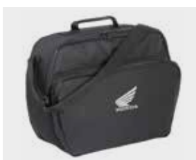
Inner Bag for 35L Top Box 08L09-MGS-D30

Black nylon bag with silver Honda logo on front pocket. Expandable from 15 to 25l. Front pocket can contain an A4-size file. Comes with adjustable shoulder belt and carrying handle.