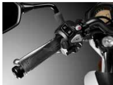
Heated Grips Kit 08ESY-MJE-HG17F Extremely slim heated grips with integrated control for maximum comfort and design integration. 3 step variable heating levels. Integrated circuit to protect the battery from draining. Smart heat allocation that focusses on the area of the hands most sensitive to cold. Attachment and special heat-resistant glue included. € 388.00