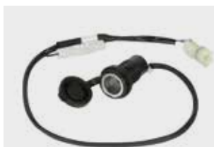
12V Accessory socket 08U70-MJW-J00

Extremely slim heated grips with integrated control for maximum comfort and design integration. 3 step variable heating levels. Integrated circuit to protect the battery from draining. Smart heat allocation that focusses on the area of the hands most sensitive to cold. Attachment and special heat-resistant glue included. € 388.00