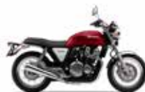
Candy Chromosphere Red