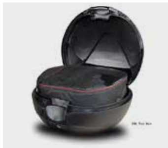
39L Top Box / 39L Inner Bag for RTB 08L39-MJW-RTB / 08L39-RTB-INNER

Complete pack including: • 39L Top Box with Back Rest • One-Key System that allows to operate the top box using the bike ignition key • Rear Carrier to be mounted on the bike. Black nylon inner bag with stylish print, red colour zips and the Honda logo on its front. Front pocket that can contain A4 size file. Comes with adjustable shoulder belt and carrying handle. € 255.00 / € 40.00