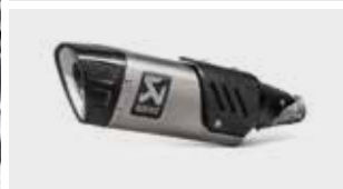
Titanium Slip-On muffler 08F88-MKJ-900

Easy to apply wheel decal kit. Silver colour-accented vinyl stripes featuring the CB1000 logo. € 79.00