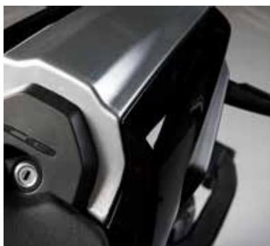
Single Seat Cowl* 08F80-MKJ-D002C

Meter visor fitted with a high quality aluminium panel to enhance the iconic look of the CB1000R. € 234.00