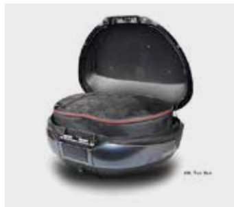
48L Top Box / 48L Inner Bag for RTB 08L48-MJW-RTB / 08L48-RTB-INNER

Complete pack including: • 39L Top Box with Back Rest • One-Key System that allows to operate the top box using the bike ignition key • Rear Carrier to be mounted on the bike. Black nylon inner bag with stylish print, red colour zips and the Honda logo on its front. Front pocket that can contain A4 size file. Comes with adjustable shoulder belt and carrying handle. € 255.00 / € 40.00