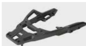
Rear Carrier 08L70-MKA-D80

Rear carrier specifically designed for the NC750S to install the 35L top box and the 29L panniers