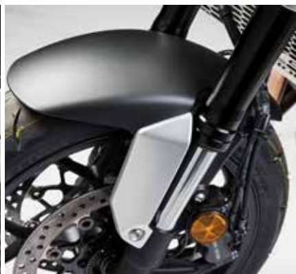
Front Fender Panel Kit* 08F79-MKJ-D00

By measuring the intensity of the shifting input, the quick shifter enables the rider to change gear without the need to operate the clutch lever or shut the throttle. The system aids upshifting and downshifting, maximizing the riding experience. € 715.00