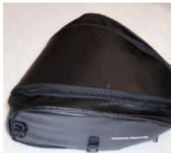
Seat Bag / Seat Bag Attachment 08L56-MGM-800A / 08L71-MJW-J00

Complete pack including: • 48L Top Box with Back Rest • One-Key System that allows to operate the top box using the bike ignition key • Rear Carrier to be mounted on the bike. Black nylon inner bag with stylish print, red colour zips and the Honda logo on its front. Front pocket that can contain A4 size file. Comes with adjustable shoulder belt and carrying handle. € 335.00 / € 45.00