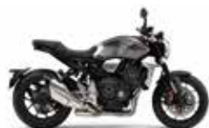
Mat Bullet Silver Metallic