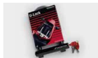
Rear maintenance stand 08M50-MW0-801 Tilting tubular steel stand that facilitates cleaning and rear wheel maintenance. Lifts the motorcycle by the end of its swingarm. € 99.00