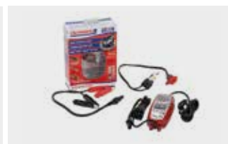
Honda Optimat 3 08M51-EWA-601E / 08M51-EWA-601U Suitable for all types of 12V lead-acid batteries of rated capacity from 3 to 50Ah. Effective on very neglected batteries from as low as 2 Volts. No risk of overcharging. Ensured safety for vehicle electronics. 2 versions available (EU or UK market) € 89.00