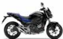
Graphite Black / Blue Metallic