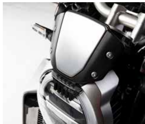
Meter Visor* 08R72-MKJ-D00

High quality aluminium panel to add to the front fender of the CB1000R. € 212.00