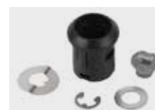
Key Body Part 08M71-MJE-D01

Key body part for one key system (wave key) Allows the pannier or topbox to be used with the bike's ignition key. One set required per pannier or topbox.