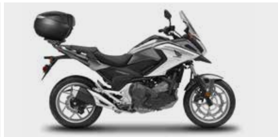
39L Top Box with Back Rest 08L39-MKA-RTB

39L Top Box with backrest, delivered with every components needed for mounting (plate, rear carrier) or to lock it with using the bike key.