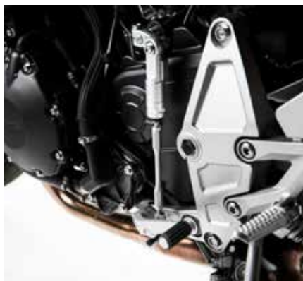
Quick Shifter* 08U70-MKJ-D00

By measuring the intensity of the shifting input, the quick shifter enables the rider to change gear without the need to operate the clutch lever or shut the throttle. The system aids upshifting and downshifting, maximizing the riding experience. € 715.00