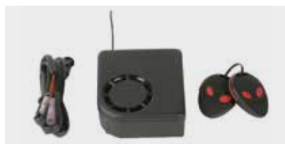
Averta Alarm Kit 08ESY-MJE-ALARM A compact alarm unit with a 118db siren featuring a movement and shock detector and 8 sensitivity settings. A back-up battery and a low consumption sleep mode ensure the battery is protected from draining. Also included: • switch allowing the rear seat cowl or pillion seat to be switched without setting off the alarm • attachment € 299.00