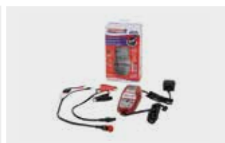
Honda Optimat 5 Battery Optimizer 08M51-EWA-801E / 08M51-EWA-801U The new Honda Optimat 5 saves batteries from as low as 2V and will then charge and maintain the battery, all automatically. 2 versions available (EU or UK market) Battery range: 15-192Ah Usage: MF / AGM, STD, GEL, EFB batteries € 89.00