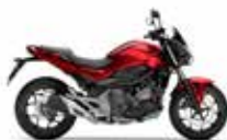
Candy Chromosphere Red