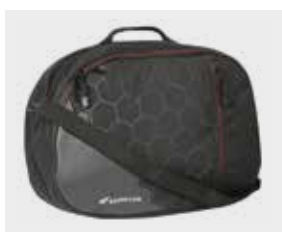
Inner Bag for 39L Top Box 08L39-RTB-INNER / 08L48-RTB-INNER

Black nylon inner bag with stylish print, red colour zips and the Honda logo on its front. Front pocket that can contain A4 size file. Comes with adjustable shoulder belt and carrying handle.