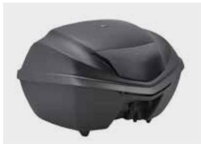
35L Top Box 08L72-MJE-D00ZA

35L Top box designed for one key system Must be combined with: