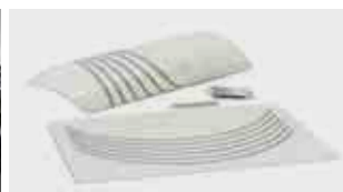
Wheel Stripe Kit 08F74-MKJ-D00ZA

High quality aluminium panel that will underline the shape of hugger for a total Neo Retro look. € 196.00