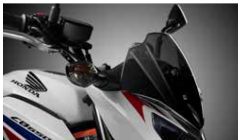
Meter visor kit 08R70-MJE-DF0 Protects from wind and improves the appearance of the bike. € 125.00