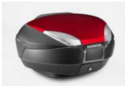
48L Top Box with Back Rest 08L48-MKA-RTB

48L Top Box with backrest, delivered with every components needed for mounting (plate, rear carrier) or to lock it with using the bike key.