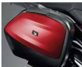
29L Panniers Set 08ESY-MKD-PA17

Pack including 2 specially designed, aerodynamic and fully integrated 29L panniers, with one key system, rear carrier, support and the requested components to install the one key system.