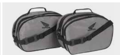
Inner Bags for 29L Pannier set 08L79-MGS-J30

Set of 2 strong, light grey, nylon-fabric pannier inner bags. 16l of carrying capacity each, front pocket included. Handle and straps for easy carrying. Black embroidered Honda logo on the front pocket.